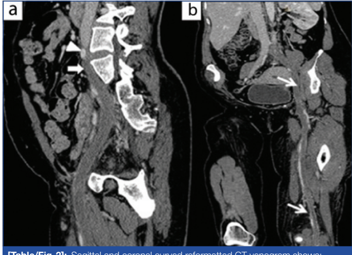
[Table/Fig-2]: Sagittal and coronal curved reformatted CT venogram shows: a) Right common iliac artery (white arrow head) seen compressing over the left iliac vein (white arrow); b) Evident thrombus involving the left common iliac vein (white arrow) from its origin extending up to the popliteal vein.

vein extending up to the popliteal vein [Table/Fig-2a,b], suggestive of MTS.