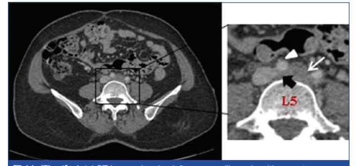
[Table/Fig-1]: Axial CT image showing left common iliac vein with more transverse course at its origin and is seen compressed (black arrow) between the right common iliac artery (White arrow head) and the lumbar (L5) vertebrae with evident thrombus involving the left common iliac vein (White arrow).

Basic workups including routine blood investigation, chest radiograph, ECG, ECHO were normal. Following which the patient was referred to the Radiology Department for a lower limb venous Doppler, which revealed an extensive left lower limb DVT involving left common iliac vein up to the popliteal vein; however, IVC appeared normal. CT venogram revealed- Left common iliac vein with more transverse course at its origin and is seen compressed between the right common iliac artery and the lumbar (L5) vertebrae with evident thrombus [Table/Fig-1] and involving the left common iliac